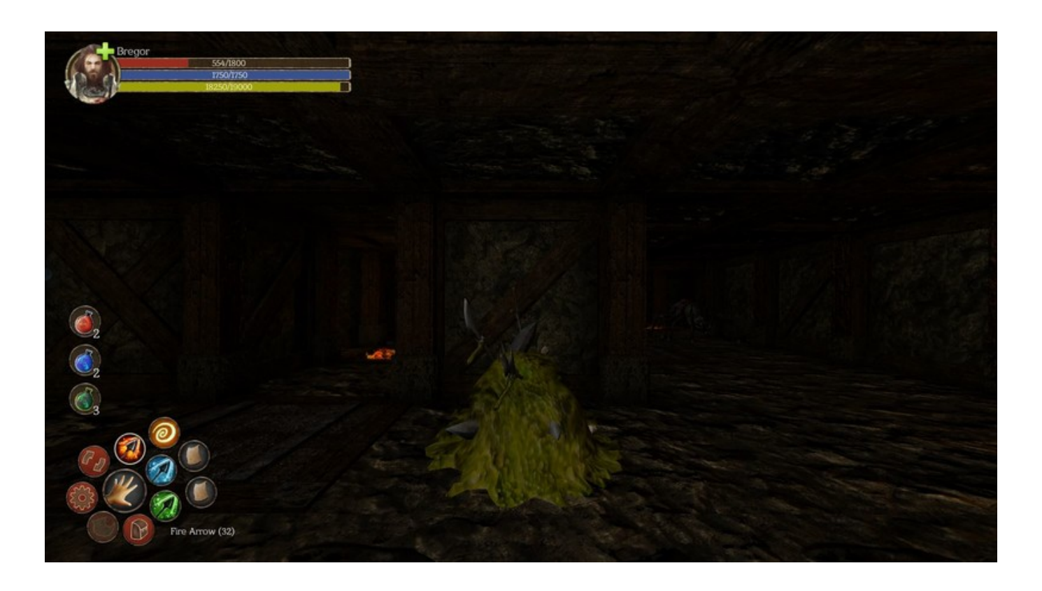
Ruzar - The Life Stone - Challenge Map Download With License Key

Download ->->-> <a href="http://bit.ly/2NGBYfy">http://bit.ly/2NGBYfy</a>